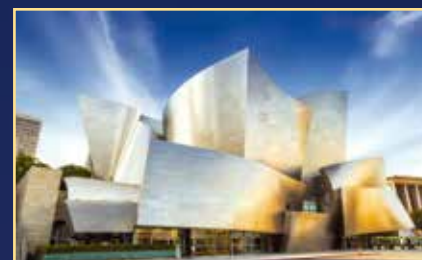
Walt Disney Concert Hall